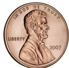
Obverse (front) of the Lincoln Memorial penny

12. Use the histogram to find a probability that a fair coin lands tails up (just by chance) as many or more times as your penny did. Do you have enough evidence to reject the belief that your penny is fair?