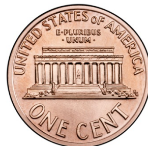
Reverse (back) of the Lincoln Memorial penny

Statisticians have a rule of thumb for making the kind of decision you made in #12 above: when the probability for some event to occur by chance is less than 5%, we tend to discard the original belief (that the coin was fair) and choose to believe the new belief (that the coin is not fair). An event that is unlikely to happen by chance is called statistically significant . That is, although lots of tails from a fair coin can occur by chance sometimes , we don't believe that it occurred by chance this one time because the probability is so small.