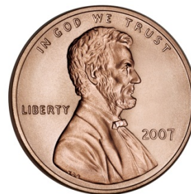
Obverse (front) of the Lincoln Memorial penny

Statisticians have a rule of thumb for making the kind of decision you made in #12 above: when the probability for some event to occur by chance is less than 5%, we tend to discard the original belief (that the coin was fair) and choose to believe the new belief (that the coin is not fair). An event that is unlikely to happen by chance is called statistically significant . That is, although lots of tails from a fair coin can occur by chance sometimes , we don't believe that it occurred by chance this one time because the probability is so small.