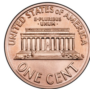
Reverse (back) of the Lincoln Memorial penny

Statisticians have a rule of thumb for making the kind of decision you made in #12 above: when the probability for some event to occur by chance is less than 5%, we tend to discard the original belief (that the coin was fair) and choose to believe the new belief (that the coin is not fair). An event that is unlikely to happen by chance is called statistically significant . That is, although lots of tails from a fair coin can occur by chance sometimes , we don't believe that it occurred by chance this one time because the probability is so small.